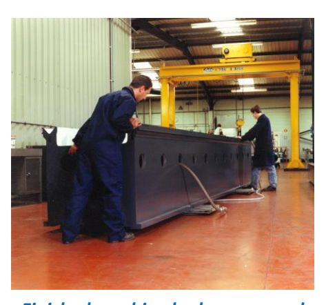
Finished machine beds are moved through a factory on Hovair AL22 air skates